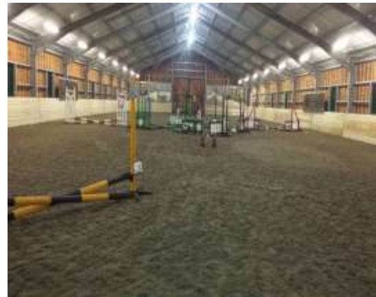
Teffont indoor school all set up for the Christmas show.